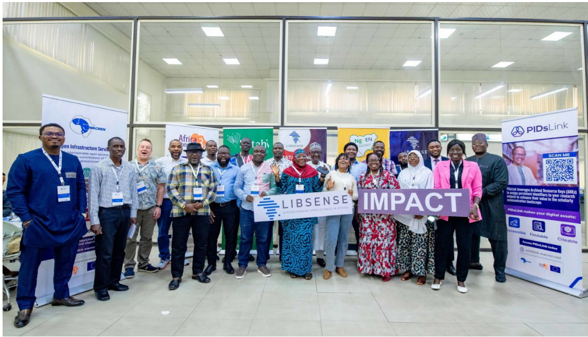
LIBSENSE-Connect gathers stakeholders in Nigeria to discuss national data repository