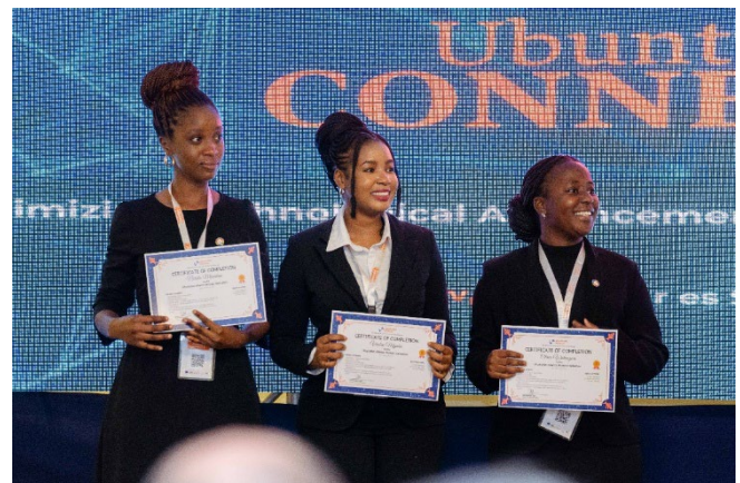
Team Zimbabwe won the 2nd Women Hackathon taking place alongside the UbuntuNet Connect conference 2024.

In order to contribute to bridging the gender gap in tech solution development, the UbuntuNet Alliance has conducted two Women Hackathons in 2023 and 2024, as part of AC3. Each year, the hackathon brought together seven teams, each consisting of three young women from universities across Africa. Guided by experts from Makerere University, the teams developed innovative solutions in research and education. To showcase their work, the Women Hackathons were held alongside the annual UbuntuNet-Connect conferences, where participants had the opportunity to present their innovations to audiences of up to 200 attendees.