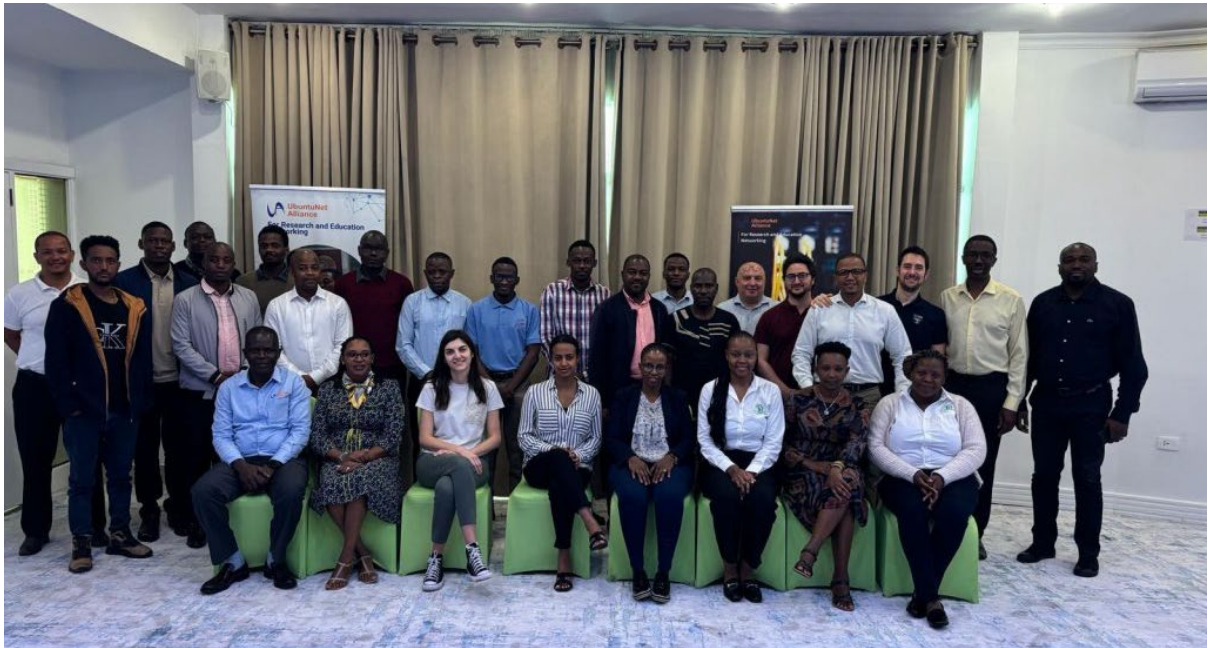
Participants of the Federation Operators (FedOps) Training hosted by EthERNet in Ethiopia in early 2024. The training was delivered by GÉANT and the GÉANT community as part of the GN5-1 project. It was an intensive five-day program in Identity Federation management and eduGAIN integration.