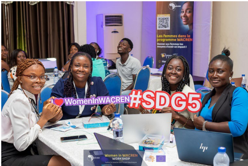
The Women-In-WACREN workshop in Ivory Coast in November 2024 focused on practically using the Python programme for weather and climate data analysis.

AC3 has also supported WACREN in building women's capacity to contribute to climate research. A total of 85 Anglophone and Francophone women participated in two workshops - the Women-in-WACREN programme - where they learned to use Python for climate data analysis and decision-making. They also explored Internet of Things (IoT) tools to enhance their research capabilities. Some participants shared their experiences and the impact of the workshops in these videos.